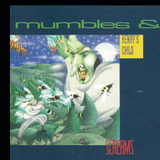
Mumbles & Screams (1995) Sportin' Bovine Records