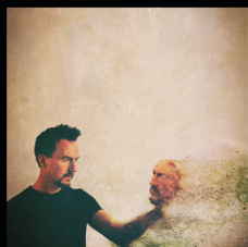
I Have Become (2019) Self-Released