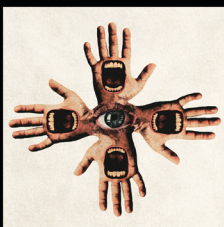
Listen Closely (2020) Self-Released